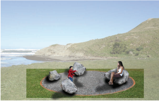
PICTORIAL B Rock seating area