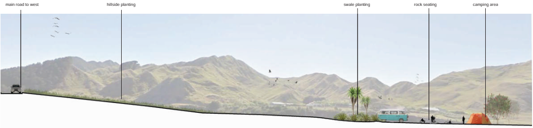
CROSS SECTION B-B NORTH VIEW